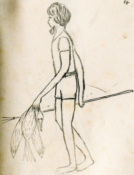
Melayu, bukar wityindaga.