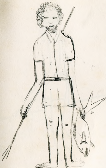
Malyry bumar guyany.