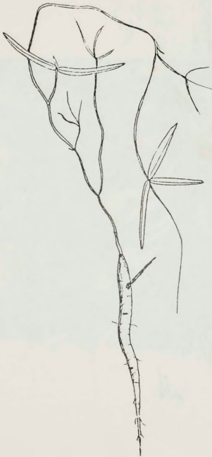
Kanhi-ka mi kutintharr