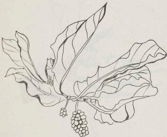
Kanhi-ka mi mamut