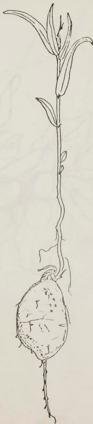
Kanhi-ka mi kumilu